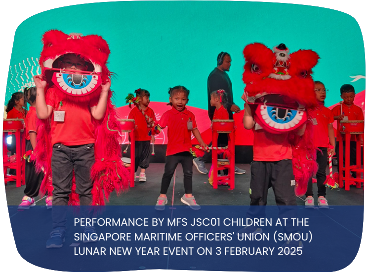
PERFORMANCE BY MFS JSC01 CHILDREN AT THE SINGAPORE MARITIME OFFICERS' UNION (SMOU) LUNAR NEW YEAR EVENT ON 3 FEBRUARY 2025