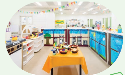
DRAMATIC LEARNING CENTRE