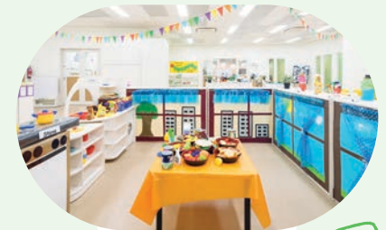
DRAMATIC LEARNING CENTRE