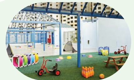
OUTDOOR PLAY AREA