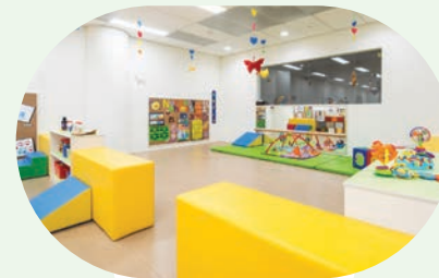
INFANT PLAY AREA