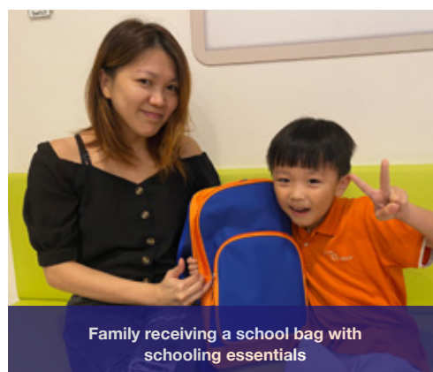
Family receiving a school bag with schooling essentials

The CapitalLand-Bright Horizons Fund Ready-For-School Programme provides schooling essentials to graduating K2 children as they prepare to transit to Primary One. A big thank you to the 33 CapitalLand volunteers for their time and effort in packing and supporting the distribution of the schooling essentials for graduating K2 children.