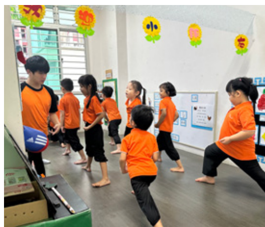
Participating in Wushu classes to prepare for their upcoming performance