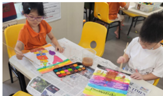
Using mixed media to create artwork

Under the You've Got Talent programme, children are given the opportunity to build their confidence and improve their self-esteem through various sports and arts enrichment programmes.