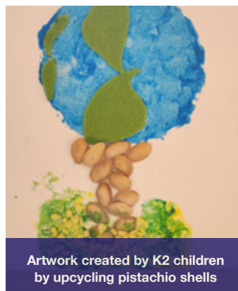
Artwork created by K2 children by upcycling pistachio shells