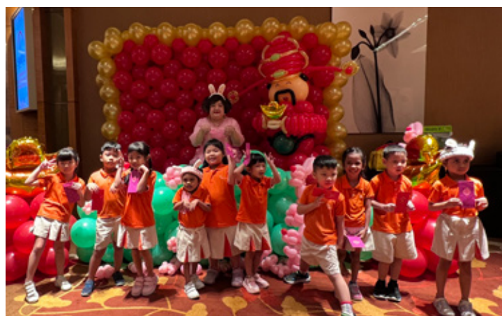
Children performing at Singapore Maritime Officers' Union Lunar New Year Luncheon 2023