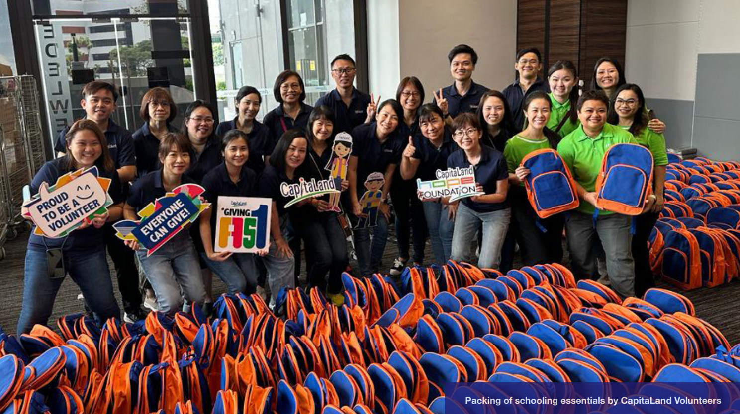
Packing of schooling essentials by CapitalLand Volunteers