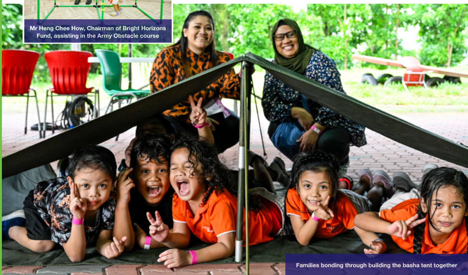
Families bonding through building the basha tent together

Scan here to read about how Bright Horizons Fund impacted the lives of many beneficiaries!