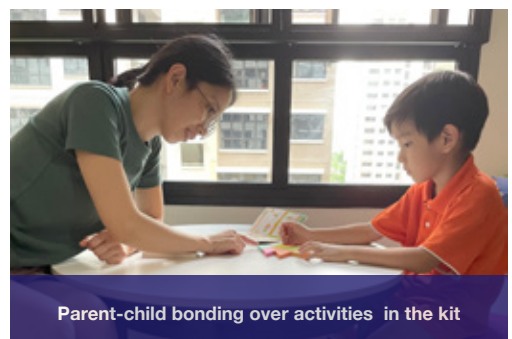
Parent-child bonding over activities in the kit