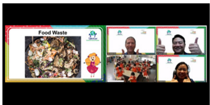
Volunteers conducting the workshop on food waste with the children

"They played games with the children to introduce the concept of food wastage and the types of waste in Singapore. This caught the children's interest and made the broad concepts simpler for children to understand."