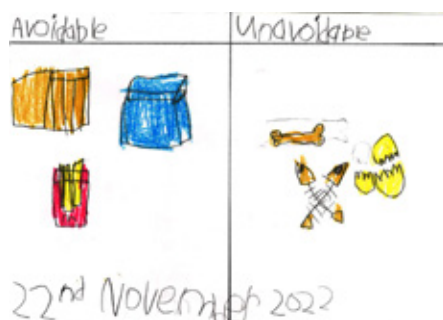
A child's drawing of what she has learnt