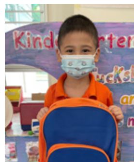
K2 child receiving schooling essentials