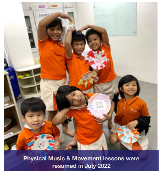
Physical Music & Movement lessons were resumed in July 2022