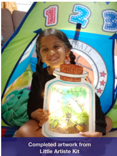
Completed artwork from Little Artist Kit

586 children benefitted from You've Got Talent Programme in 2022