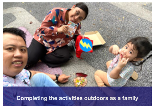
Completing the activities outdoors as a family