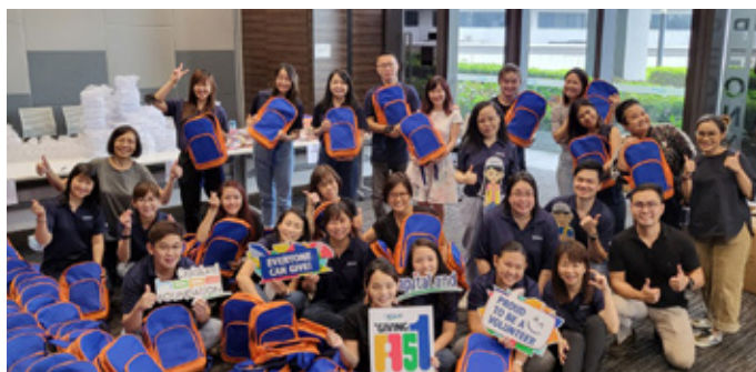
Volunteers who supported the packing of schooling essentials for K2 graduating children

A huge thank you to the 23 CapitaLand Hope Foundation volunteers who packed and supported the distribution of 1,062 schooling essentials for K2 graduating children in 2022.