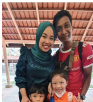
Family receiving the schooling essentials with their K2 child