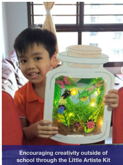
Encouraging creativity outside of school through the Little Artist Kit