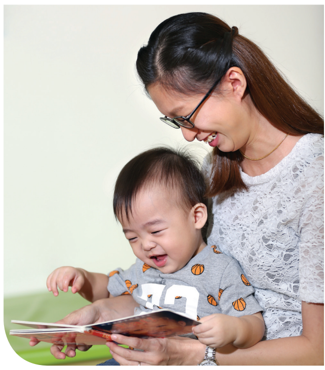
Learning and development of children from birth-to-three years can be enhanced with a curriculum that is based on developing strong educarer-child relationships.

The study was recently published in Springer, a leading international science journal publisher, further validating NTUC First Campus' move to a new Relationships-Based Curriculum at its childcare centres.