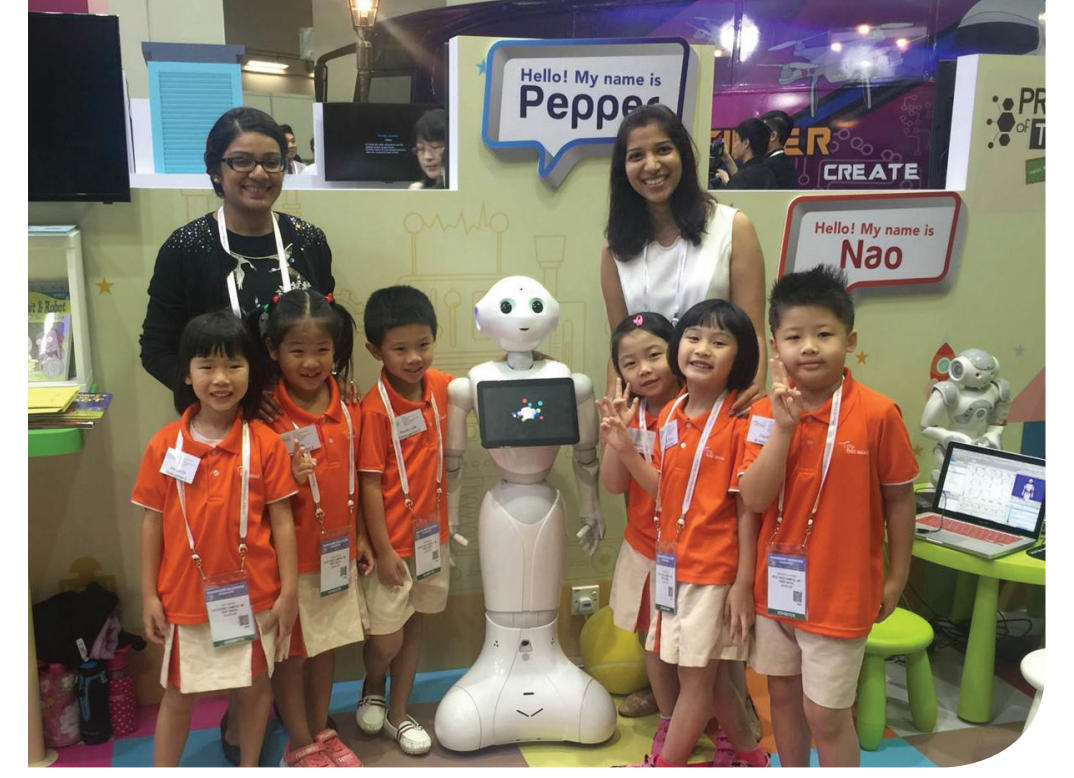
Children from My First Skool at Jurong Point Shopping Centre shared and introduced Pepper at IDA education booth to showcase the 'Pre-school of Tomorrow'