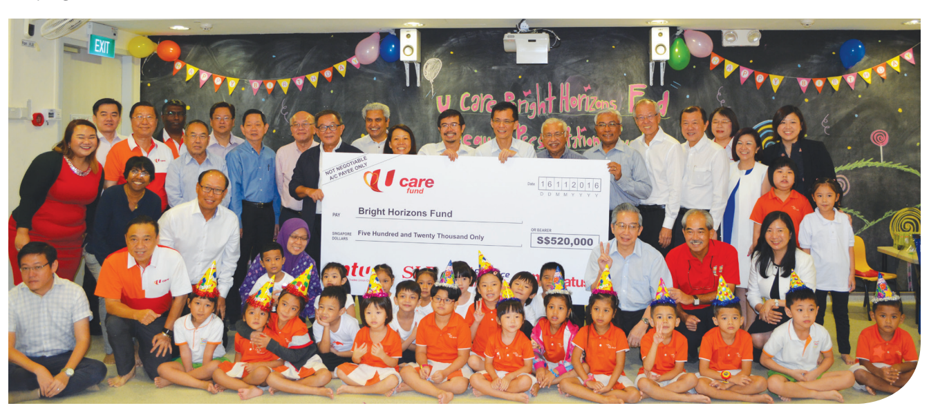
The cheque donation of $520,000 was presented to BHF at a "You are Special" celebration held at My First Skool at Blk 54 Chin Swee.

In 2016, the fund disbursed $1 million to support 1,600 children from underprivileged families. The NTUC-U Care Fund is the major donor to the Bright Horizons Fund.