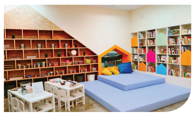
The Early Literacy Centre offers programmes in partnership with performing artists, authors and more to bring out the performing elements of literacy.

The centre also organises activities for children from different age groups to develop literacy skills in listening, speaking, reading and writing. To facilitate experiential learning, the centre is organised into different zones. Key highlights include the "Maker's Space" where The Little Skool-House collaborates with industrial partners to supply clean reusable parts (plastic) for children to recreate and reuse them.