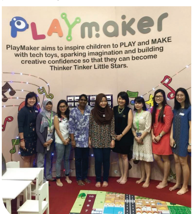
The PlayMaker programme was piloted to 33 My First Skool centres to provide children with the opportunity to learn through a suite of child-friendly, technology-enabled toys.

In addition, the PlayMaker programme provides children with the tools to have fun, as well as to experiment and problem-solve together.