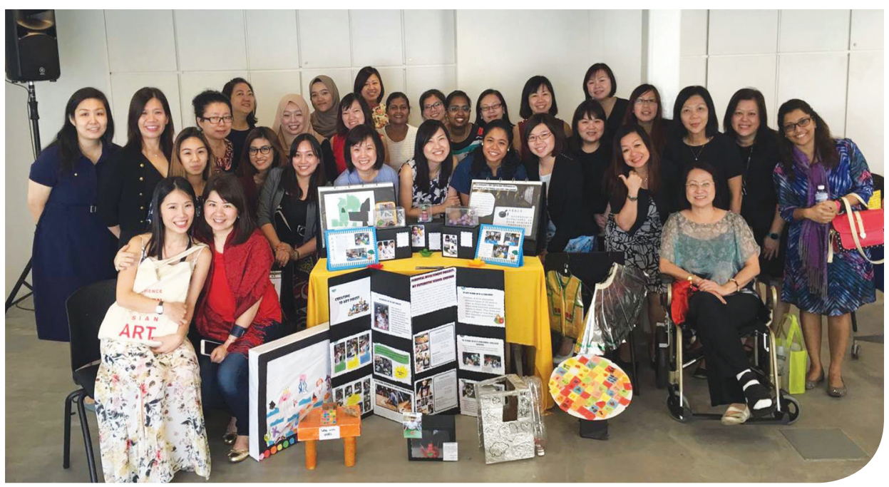
My First Skool's partnership with National Gallery Singapore to curate quality arts education programmes.