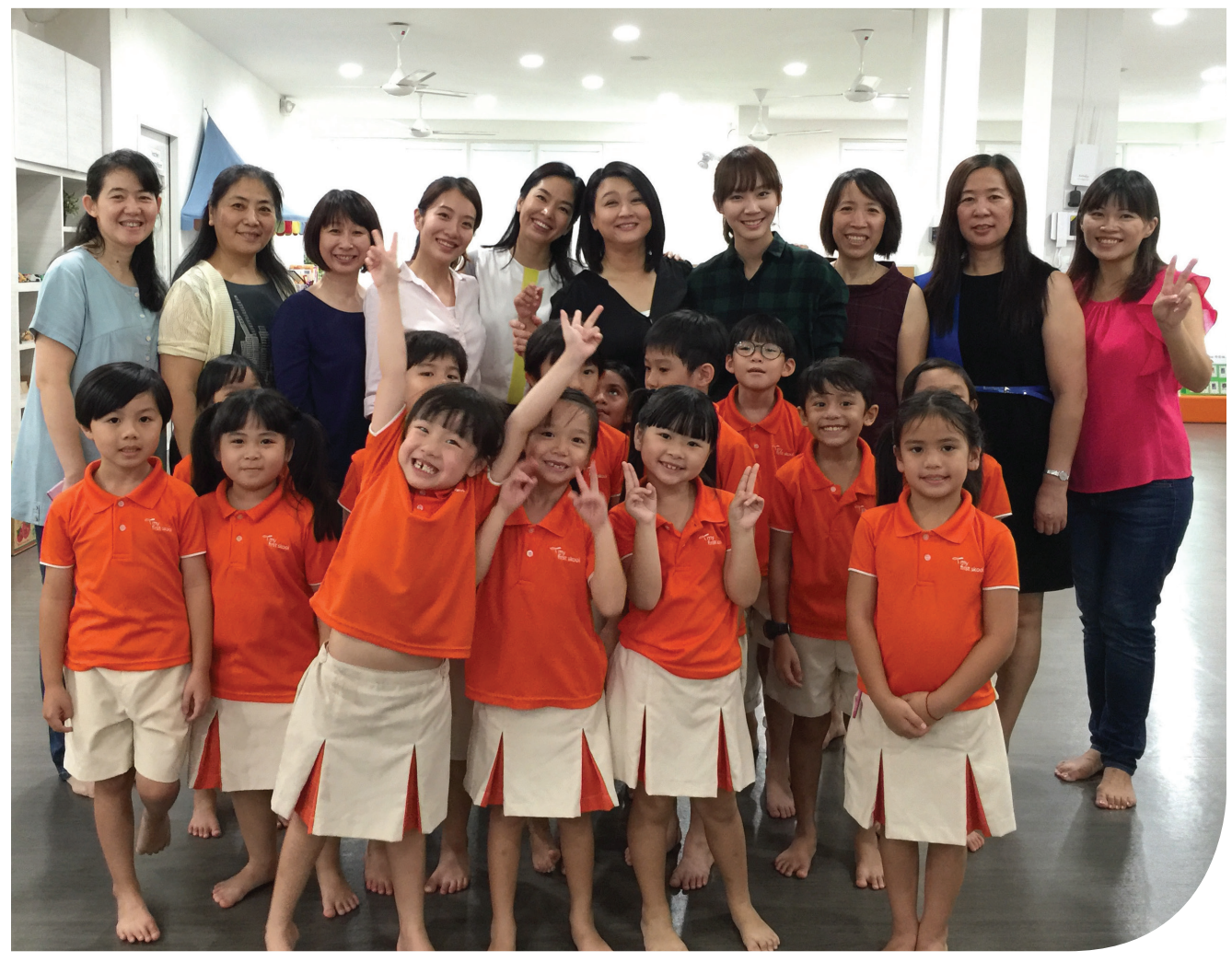
MediaCorp drama, "My First School" brings to light the many rewarding aspects of being an early childhood educator.