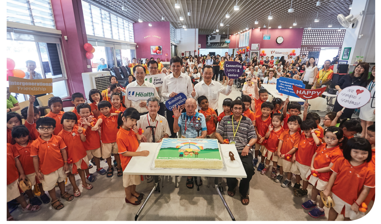
Mr Chan Chun Sing at the announcement of the structured approach to enhance inter-generational interaction in Singapore.