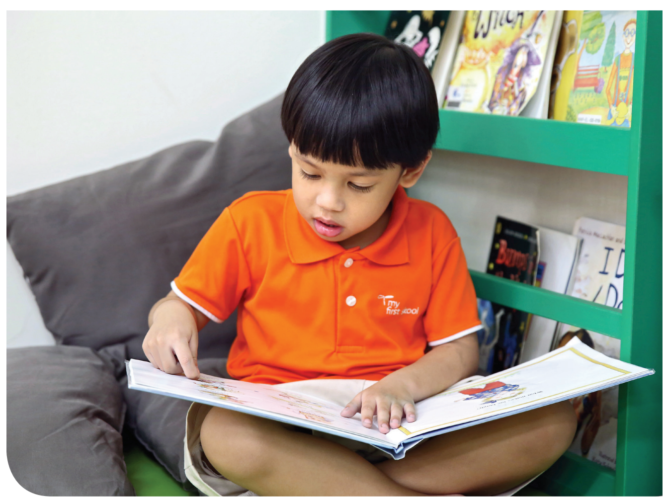
Malay and Tamil Language Pilot Programmes aim to improve fluency in mother tongue languages in pre-school children.

Based on surveys, parents were pleased that their children had started to converse in their mother tongue at home. They also shared that their children look forward to their mother tongue language classes.