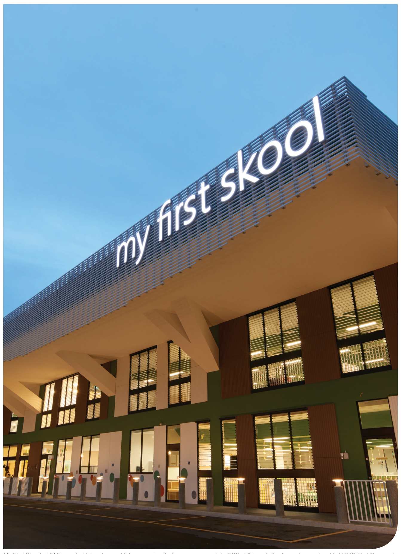
My First Skool at 51 Fernvale Link, a large childcare centre that can accommodate 500 children, is the largest pre-school in NTUC First Campus' network of 150 centres.