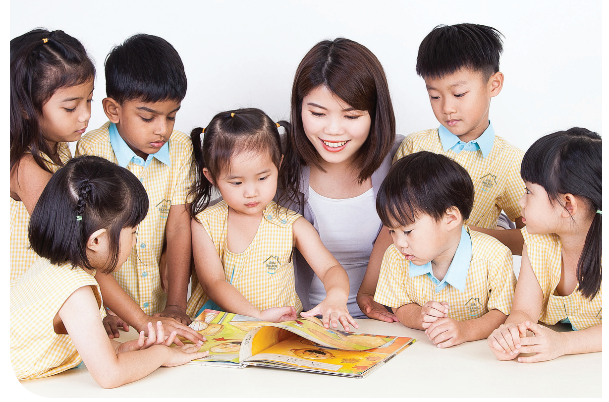
The Little Skool-House was recognised for its quality track record and was awarded with Early Childhood and Development Agency's Partner Operator status in 2016.