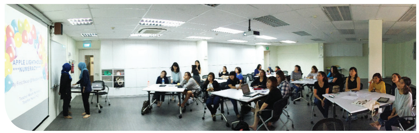
My First Skool teachers sharing the experiences on applying technology to support learning with their colleagues.