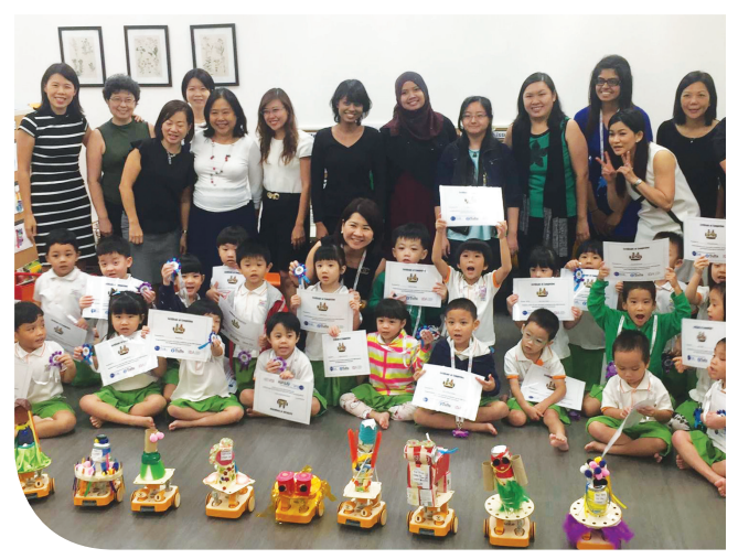
KIBO robots help to cultivate children's interests in programming in a fun way.

The study was part of a larger country-wide initiative to increase the use of developmentally appropriate engineering tools in the early childhood classroom. Results indicated that the children were highly successful in mastering foundational programming concepts.