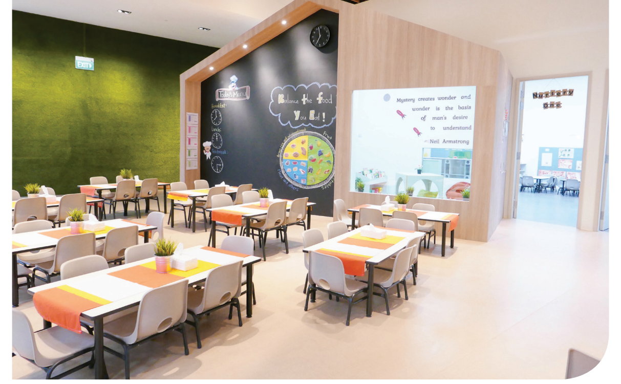
The Little Skool-House (LSH) opened its first Early Literacy Centre at Downtown East, with the aim to deepen the tenets of the LSH's Literacy-Based Curriculum.