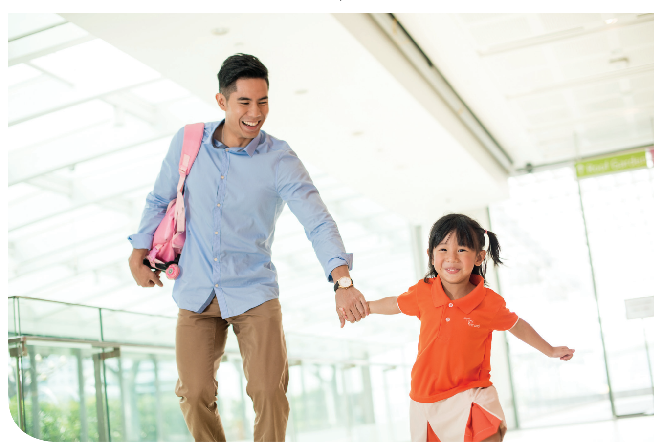
NTUC First Campus aims to strengthen partnerships and develops close bonds between educators and parents.

NTUC First Campus plans to extend this workshop series to 37 My First Skool pre-schools and one The Little Skool-House pre-school in 2017.