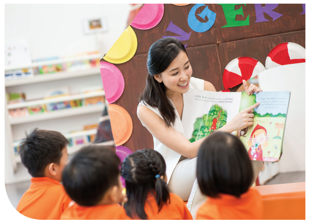
NTUC First Campus provides financial, social and developmental support programmes to children from underprivileged families and those with learning needs through its Child Support Model.