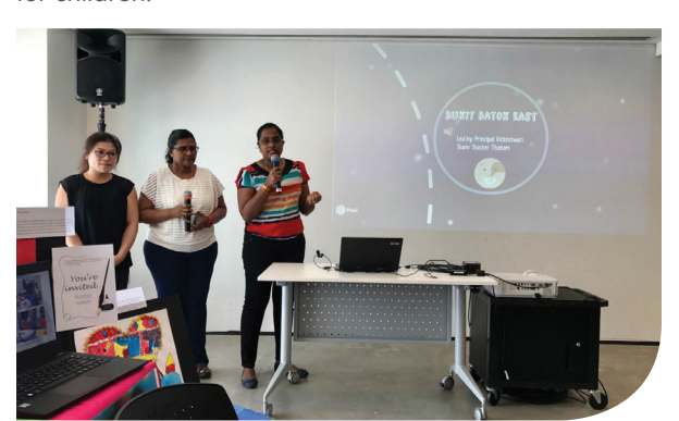
My First Skool teachers sharing their experience with their peers to exchange ideas for the co-creation of art-infused lessons.

The programme would encompass artist-led professional workshops, art visits, exhibitions and art-infused programmes for children.