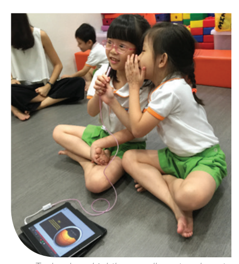
Technology Lighthouse allows teachers to apply new teaching practices to enhance the joy of learning.