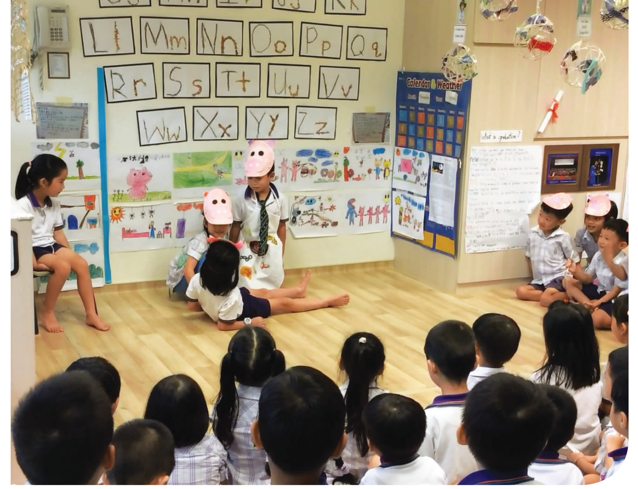
Children were encouraged to take the lead, be co-constructors in scripting their own stories, and were assigned roles and responsibilities before presenting their stories to an audience.