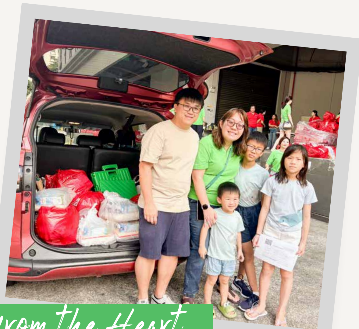
Food from the Heart

$18,000 was raised for BHF by close to 500 employees at our NFC Day Out