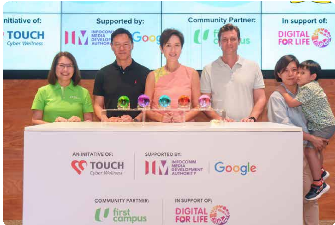
Partnered with TOUCH Community for the First Device campaign , helping families navigate digital journeys