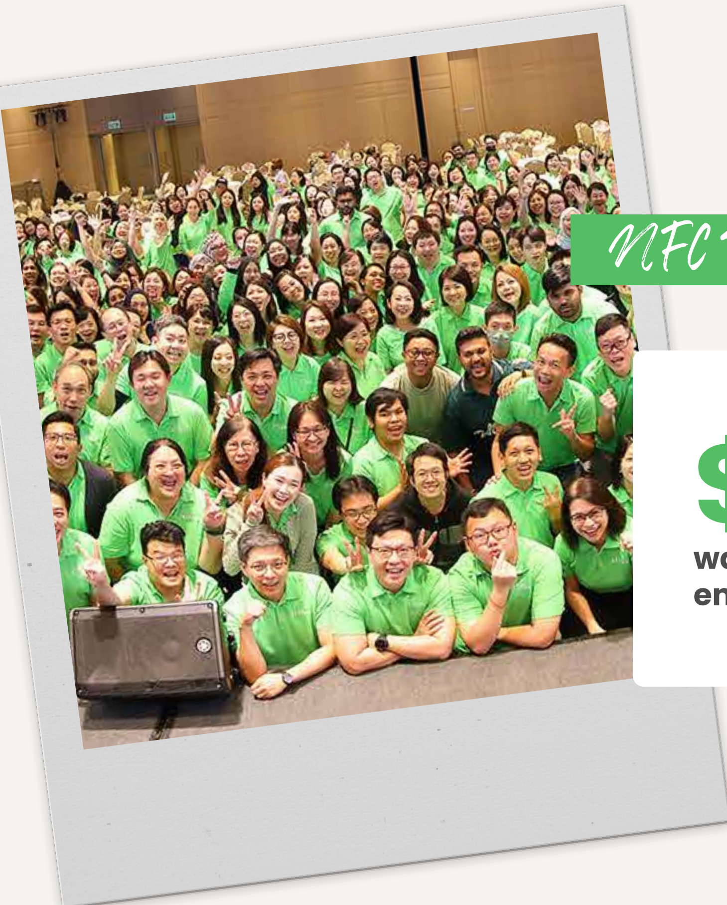
NFC Day Out

$18,000 was raised for BHF by close to 500 employees at our NFC Day Out