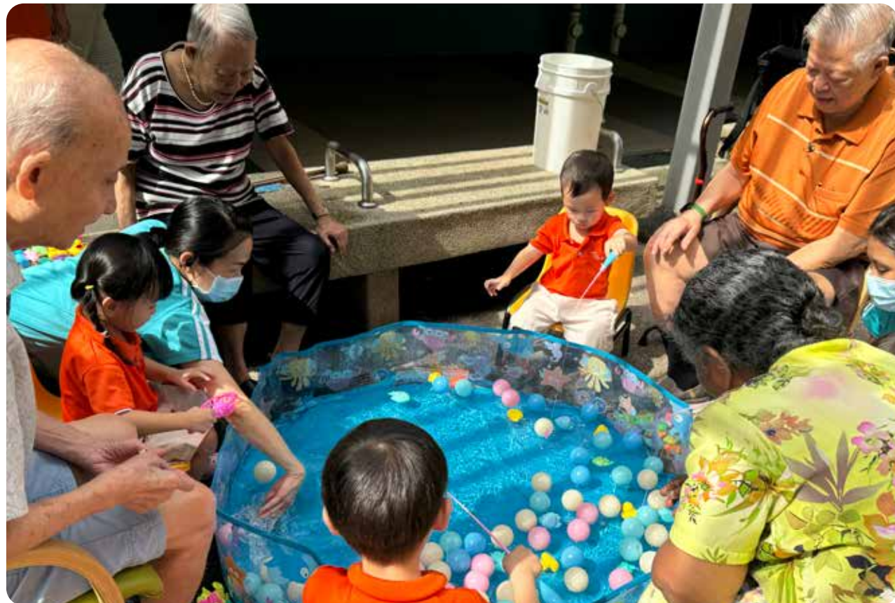
Engaged >12,000 children and 2,000 seniors through our Intergenerational (IG) Programme