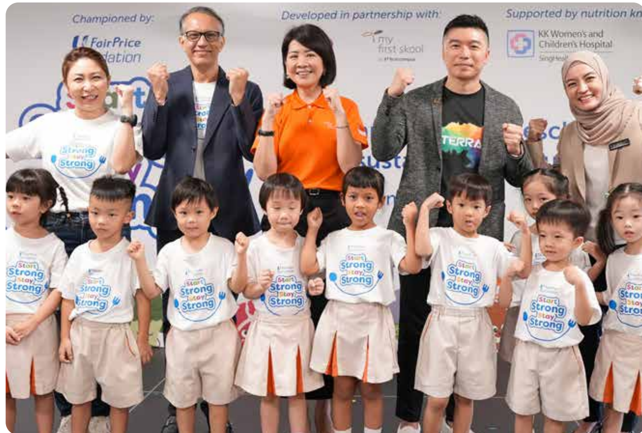
Partnered with FairPrice Group and FairPrice Foundation to launch 'Start Strong, Stay Strong' inspiring wellness and sustainability